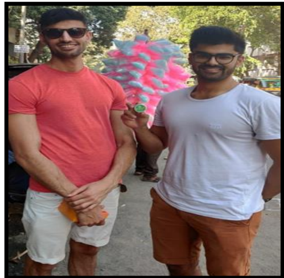
Participants of the event selling the products