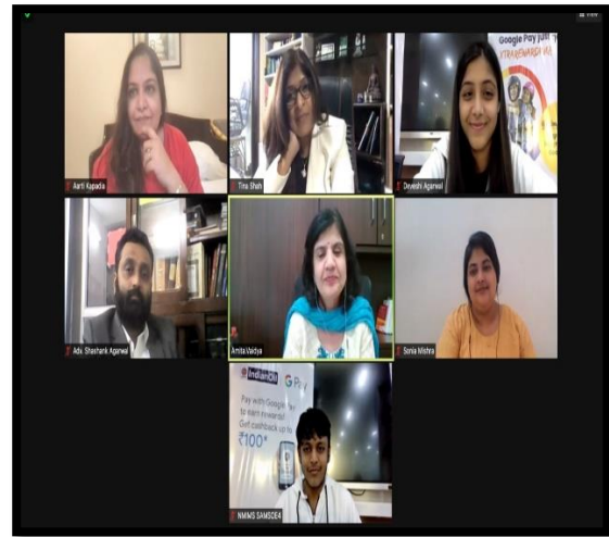
Students participating in online mode