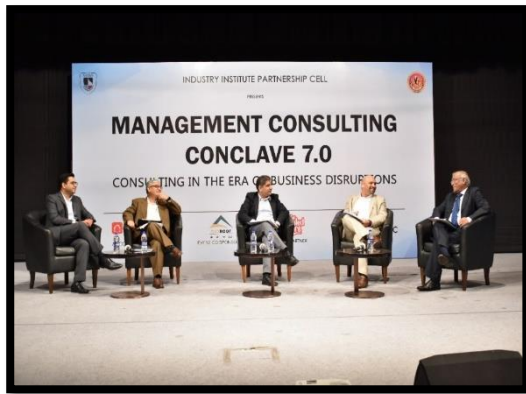
Speakers of the session