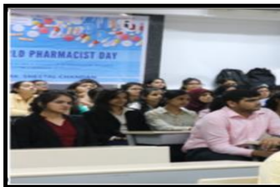
Students participating in the event