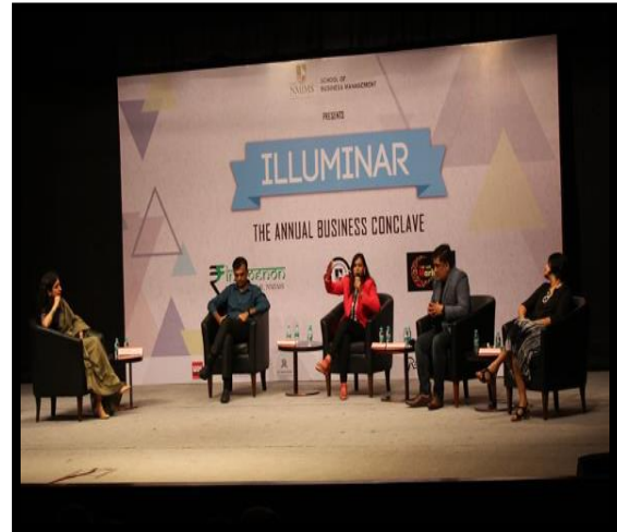
Guest Speaker / Panellist at the event